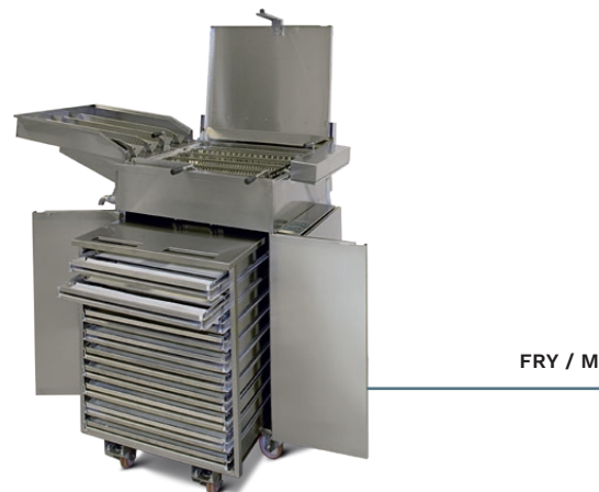
FRY / M