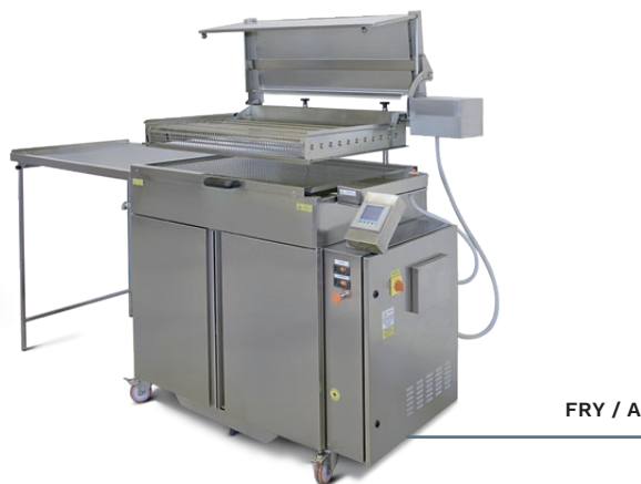
FRY / A

Our machines are designed, manufactured and assembled in ITALY. - Le nostre macchine sono progettate, costruite e assemblate in ITALIA.