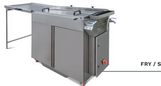
FRY / S