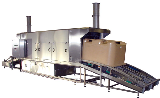
Washing machine 450MBH For pallet boxes.