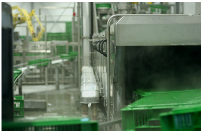
Complete automated crate handling systems