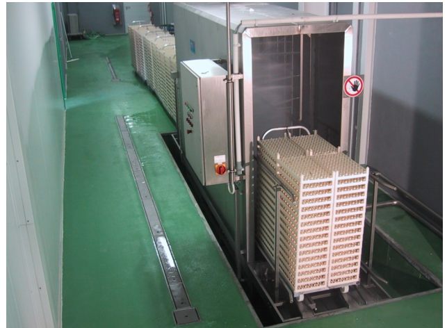
Washing machine Mafo 340MLPH with separate tank unit for extra low infeed