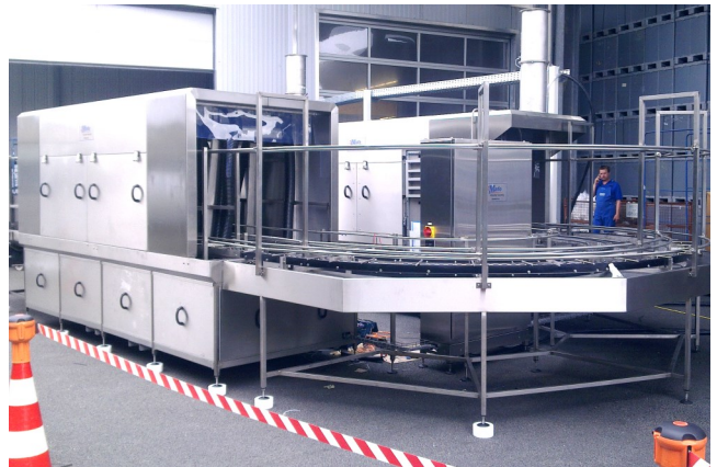
Washing machine Mafo 450MBH with Mafo 470MBHA Blow-Off For pallet boxes.