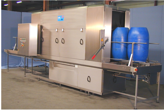
Washing machine 340MHH For 200L barrels