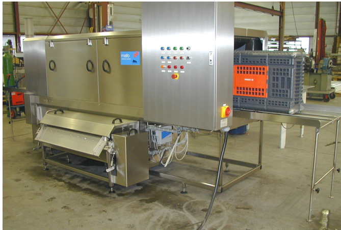
washing machine Mafo 340MPV For live bird crates.