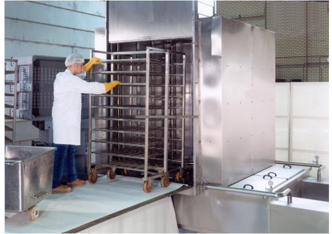
Cabin washing machine Mafo 250K For smoke racks .